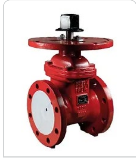
CF-300 (SIZE 4" TO 12")